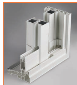
Corner Cross Section

It's our first, last and middle names. Some of the most skilled and experienced craftspeople make our products with such overwhelming pride. They make sure you receive...All vinyl multi-chamber profile design...Full perimeter double and triple weather stripping...Removable panel support...Premium sealant...Anodized aluminum tracks...Zinc plated double tandem wheels with sealed bearing...Extruded aluminum screen. Everyone at OceanView shares one and only one goal: providing customers with not only the highest quality, longest lasting, easy-to-use doors but also highest value products available anywhere.