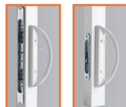
Twin Point Lock/White